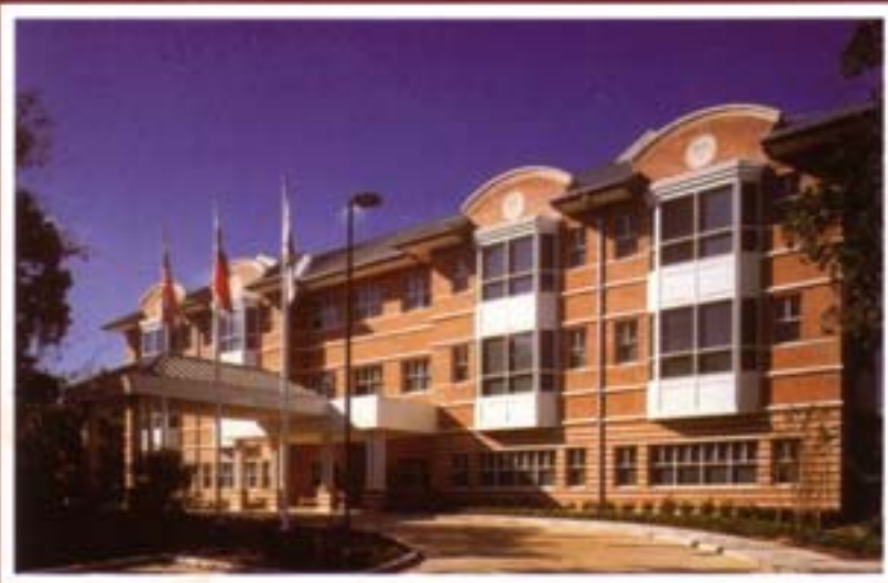
MOORES SCHOOL OF MUSIC UNIVERSITY OF HOUSTON