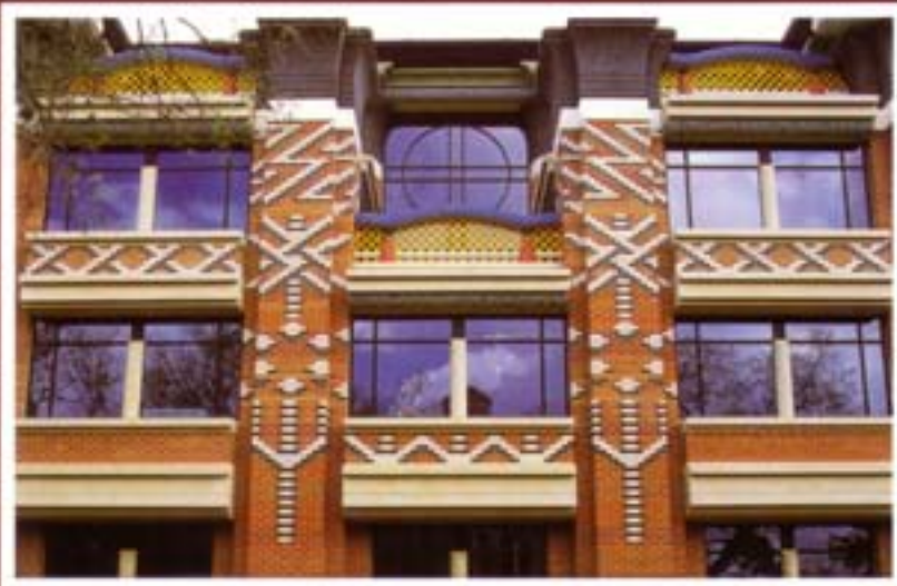
RONALD McDONALD HOUSE HOUSTON, TEXAS